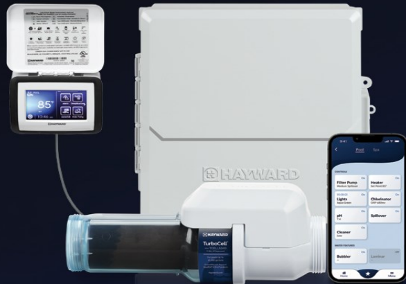
AQUARITE® S3 OMNI® SALT CHLORINATION SYSTEM

REQUIRES 1/3 THE SALT OF THE COMPETITION.*